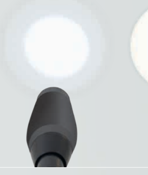
This is a conventional LED

The compact illumination head (Ø app. 60mm) allows an almost coaxial illumination, particularly in difficult application situations.